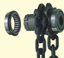
Needle bearings on load sheave